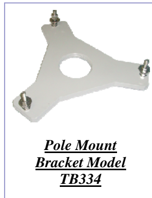
Pole Mount Bracket Model TB334