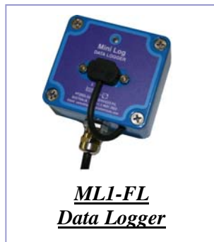
ML1-FL Data Logger