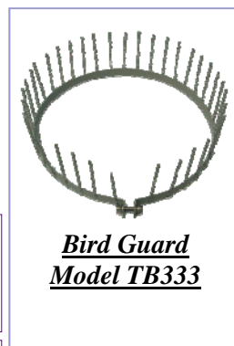
Bird Guard Model TB333