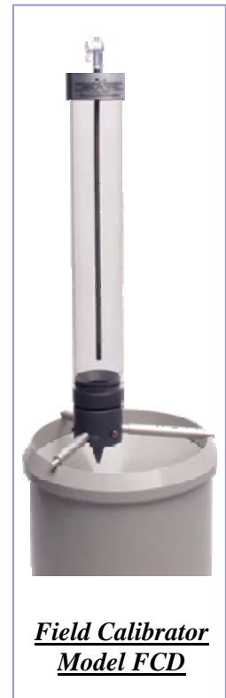
Field Calibrator Model FCD