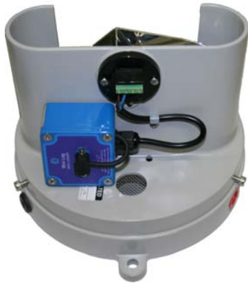
TB3 Base with optional ML1-FL

The Tipping Bucket Raingauge can be used in conjunction with Hydrological Services data logger model ML1-FL. The logger is rugged and compact, it records the date and time of occurrence of tips from the raingauge up to 100,000 events with 1 Second Resolution can be stored in the ML1-FL's memory. The data is stored in a flash EPROM.