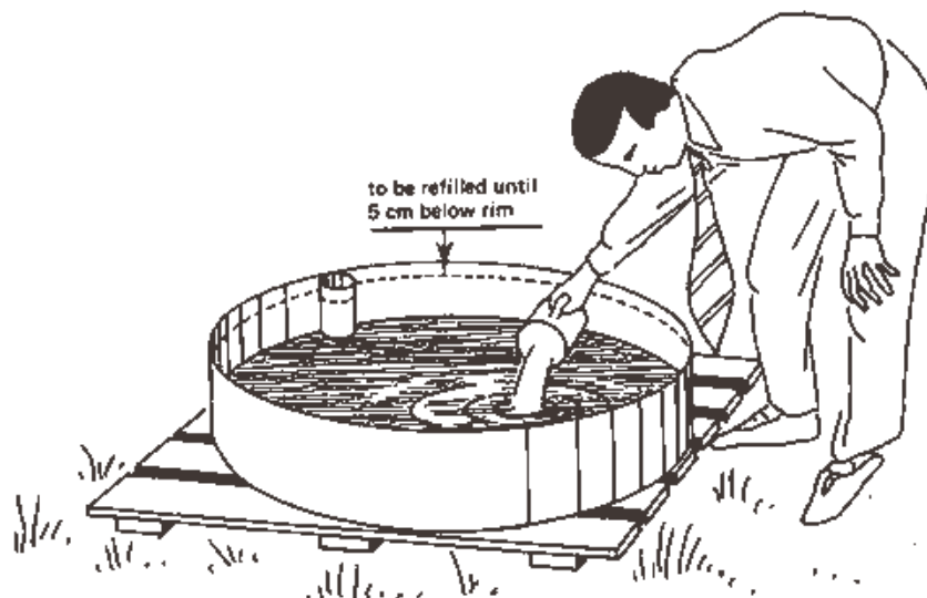
Figure 3: Refilling water to the fixed point gauge (datum).