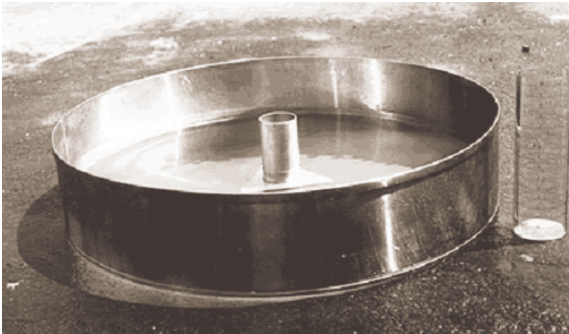
Figure 1: CLASS A EVAPORATION PAN WITH FIXED POINT GAUGE AND MEASURING CYLINDER

The Class A Evaporation Pan is used for measurement of water evaporation. It is normally installed on a wooden platform set on the ground in a grassy location. The pan is filled with water and exposed to represent an open body of water. The pan is filled to the datum in the fixed point gauge. The evaporation rate can be measured by hook gauge or by refilling to the datum in the fixed point gauge.